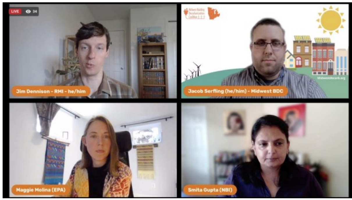
Panelists discussed emissions and equity issues related to water heating last week at the 2022 Hot Water Forum, which drew record attendance.