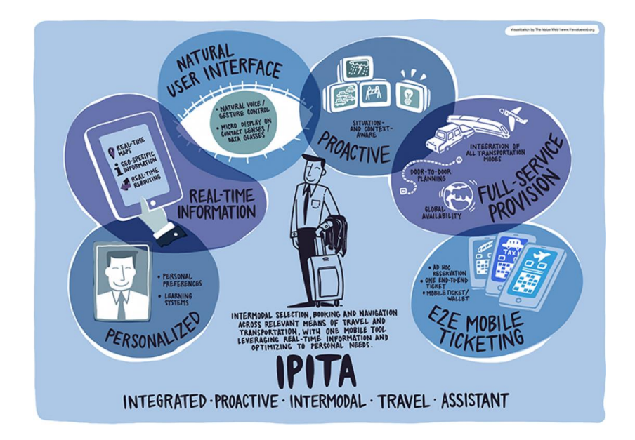
Figure 2. Integrated proactive Intermodal travel assistant.

Making cost and time information available to commuters at what is effectively the point of purchase for transportation services could help to boost ridership on public transit and increase active transportation options like walking and biking. Multimodal payment and planning apps help to reduce wait times, increase predictability, and coordinate connections between different mobility options. In addition, with real-time data that allow for better control over personal schedules, people accustomed to driving may be more open to using other modes, thereby lessening their dependence on personal vehicles for certain trips and reducing overall vehicles miles traveled. More sophisticated versions of these apps could potentially include data on time taken to find parking as well as plan detailed travel routes on multiple modes to further encourage people to get out of their cars.