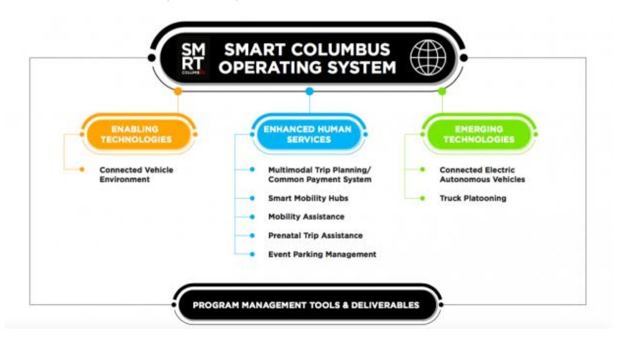
Figure 3. Smart Columbus operating system.

Since winning the US DOT's Smart City Challenge in 2016, Columbus, Ohio, has poured a significant portion of its winning monies into the creation of a centralized Smart Columbus open-source operating system, a key component of its efforts to create a smart city (figure 3). Through a smartphone app, users will be able to identify whether bus, train, or Lyft would be fastest for their journey and learn whether any micro-mobility options are available for their first and last miles (Frost 2019).