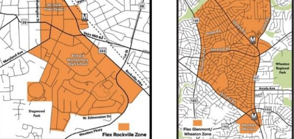
Figure 5. Flexible-demand bus service in Rockville and Glenmont/Wheaton.

Recognizing the need to connect households to areas that typically cannot be accessed by fixed-route services, Montgomery County officials partnered with ride-hailing company Via to come up with a low-cost alternative to traditional transit options. The pilot was officially implemented in June 2019, and the county hopes that the program will help fill first- and last-mile gaps in service for daytime and commuter trips (Go Montgomery 2019).